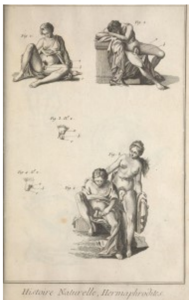
The first of three plates on Hermaphrodites in the Recueil de planches.

The giant project of the Encyclopédie was supplemented by several volumes, including a separate series of plates. The third of these Supplément volumes contained an article on hermaphrodites that was even longer than that of the Encyclopédie . It was written by Albrecht von Haller, Hugues Maret and Jean La Fosse; a long section for which no author is given is in fact lifted from the Dissertation sur les hermaphrodites by George Arnaud de Ronsil (Klöppel 2010, 174; for more details, see https://intersex.hypotheses.org/365 ).