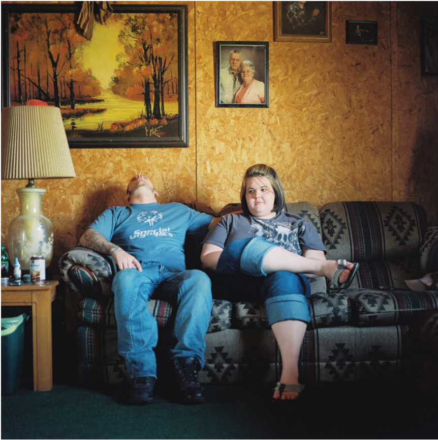
Figure 1. Couple recovering from domestic chemical exposure. Oklahoma, March 2012.

cals and the atmospheres they animate. Beyond chronicling how bodies are materially and affectively caught up in the breathing spaces of the built environment, I seek to ethnographically elucidate the “somatic modes of attention” that render minute exposures knowable (Csordas 1993). As Lauren Berlant (2011, 15) has noted, “bodies are continuously busy judging their environments and responding to the atmospheres in which they find themselves” (see also Latour 2004, 206). Bodies are sites for both actively absorbing the world and being put into motion by its constituent medley of humans and nonhumans.