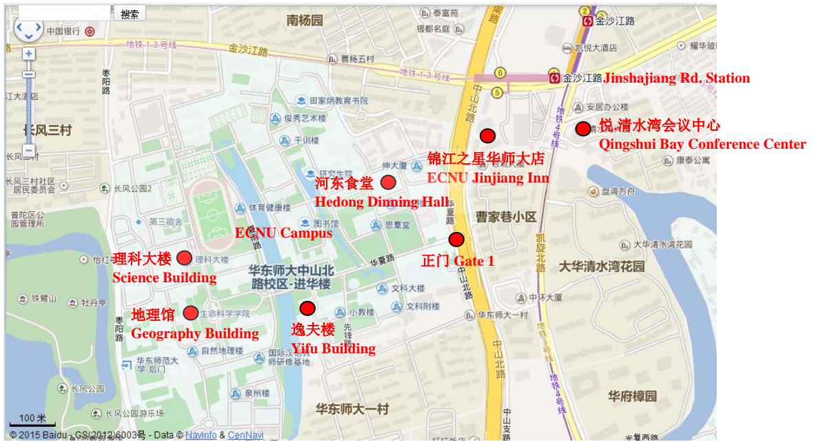
The campus and the hotels